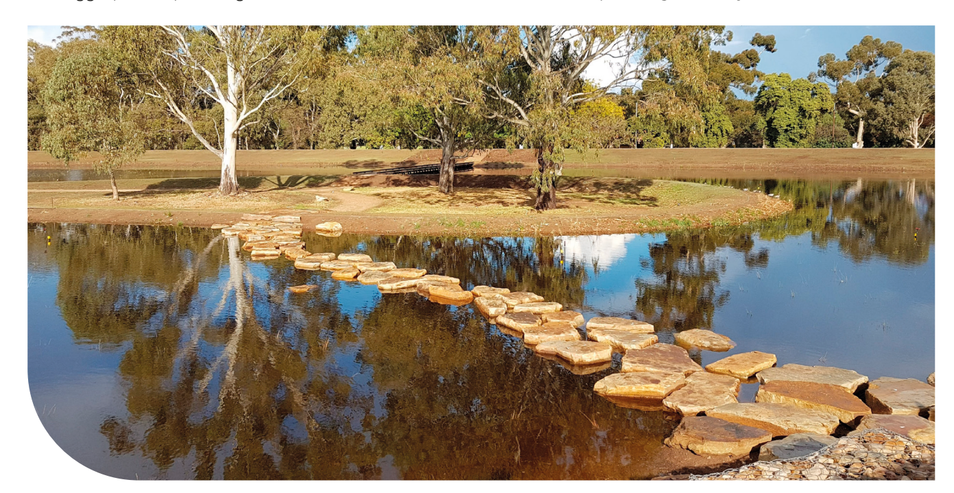
Opening day of the wetlands in Victoria Park/Pakapakanthi (Park 16). Shown here are the steppingstone bridge across the wetlands to a path through a collection of regulated trees and a bridge to the southwestern bank of the wetlands (Beaumont Road is behind the bank).

Kadaltilla has a responsibility to provide advice on policy, development, heritage or management issues affecting the Adelaide Park Lands. This advice can be provided on the basis of any request or on its own initiative. At its meeting in February 2022, in response to a request from Council, Kadaltilla supported the commencement of a Master Plan for Victoria Park/Pakapakanthi (Park 16) to enhance the environmental qualities of the park. Development of the master plan began in May 2022.