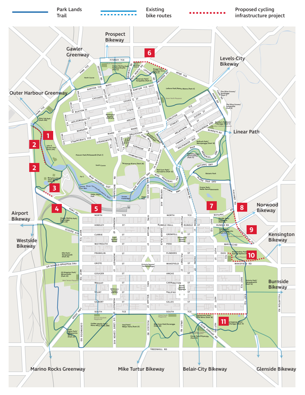
Figure 2: Map of the Cycling Infrastructure Projects in the Adelaide Park Lands.