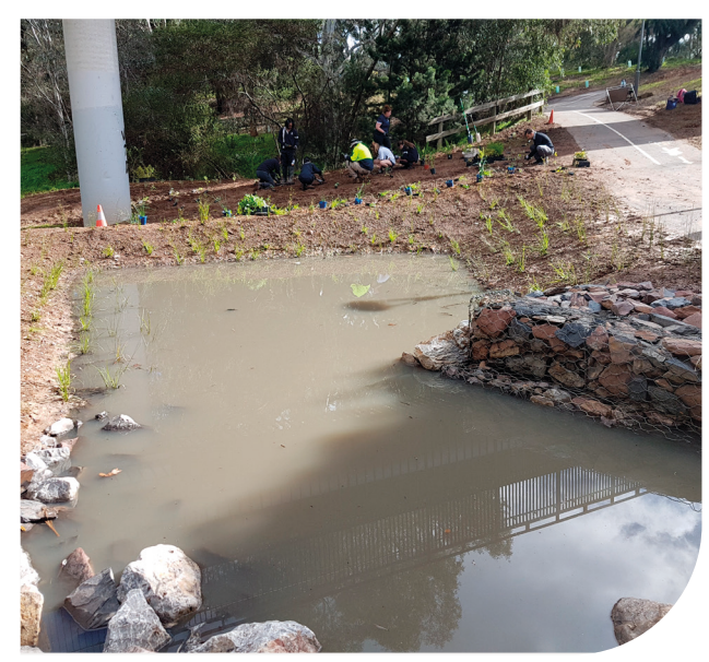
Basin site – looking west. The ephemeral stormwater retention basin with students from Pulteney Grammar School assisting staff with planting local native species. Tree guards from other local native revegetation plantings can be seen in the background. At the project's completion, all the bare/grass ground will be planted with local native species.

City of Adelaide with funding support from Green Adelaide, delivered an urban address and gateway at Hackney Road Bridge. A small 50m2 stormwater retention basin and approximately 1,200m2 of Park Lands was revegetated with over 5,000 local native plants to improve water quality and attract local biodiversity such as woodland birds and native bees. Interpretive signs on Water Sensitive Urban Design have been installed at the basin's edge and a directional sign at the intersection of three paths provides information recognising Kaurna cultural heritage and the River Red Gum Woodland.